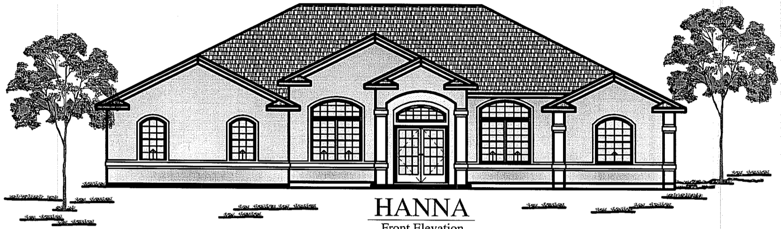
HANNA Front Elevation