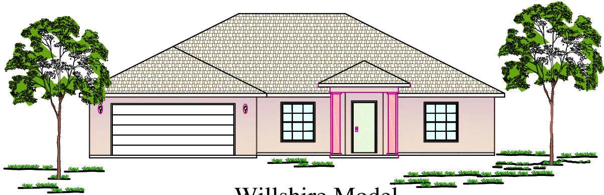
Willshire Model FRONT ELEVATION