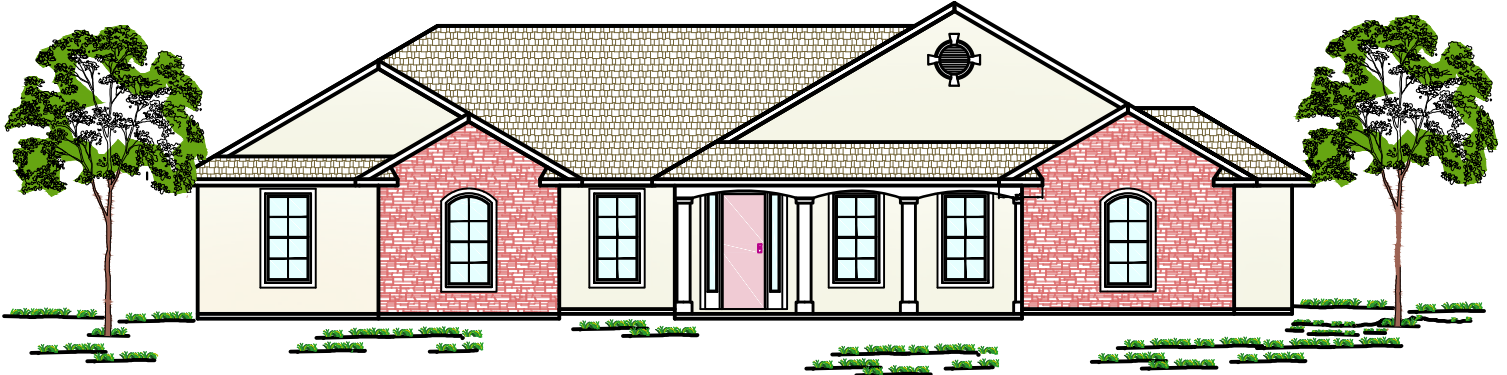
Ayden II Model FRONT ELEVATION